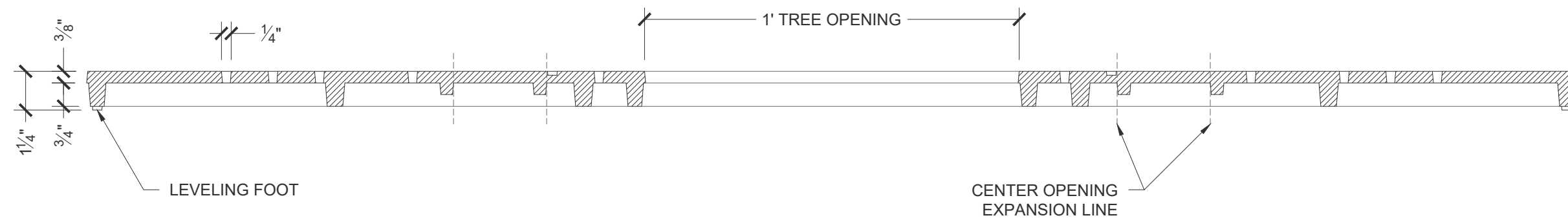
Cross Section Scale: 3" = 1' 0"

This print is the property of Urban Accessories, Inc. and is loaned to the recipient subject to be returned on demand. All contents herein are confidential and must not be copied or submitted to outside parties for examination without the express written consent of Urban Accessories, Inc.