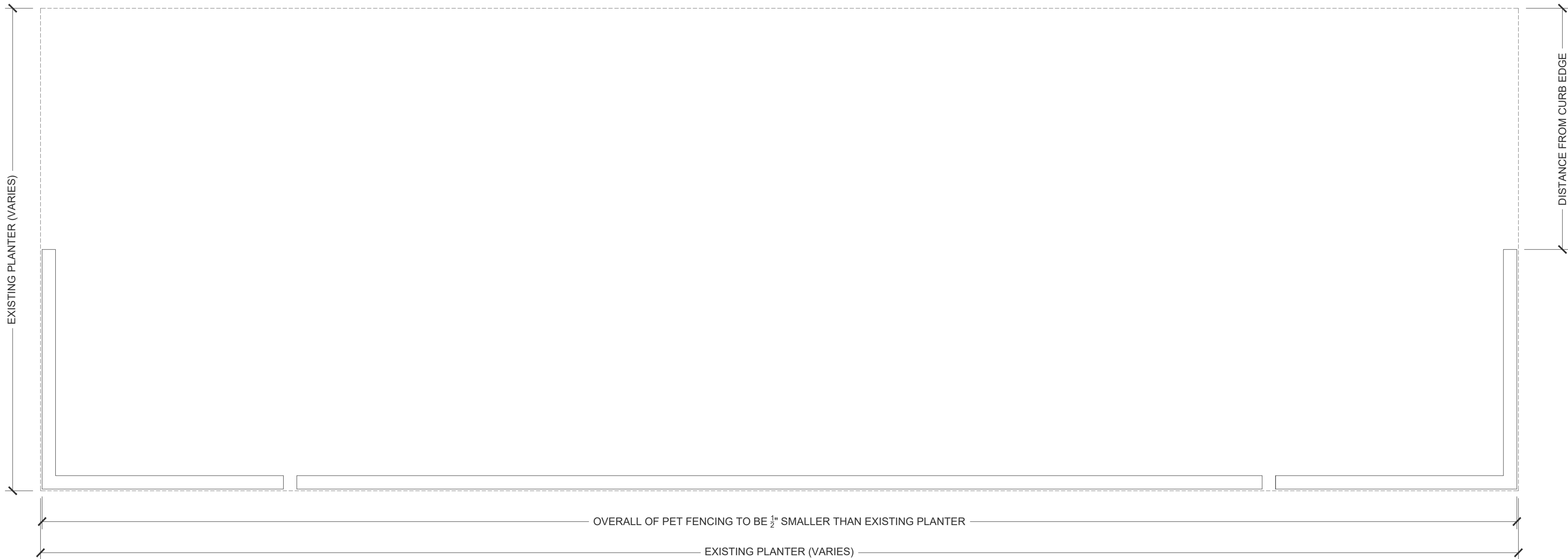
Typical Elevation - Side Mount (Sidewalk) Scale: 1" = 1' 0"

If you received these documents in mistake please contact sales@urbanaccessories.com .